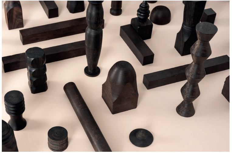
Detail (Unintended monument No: 3)