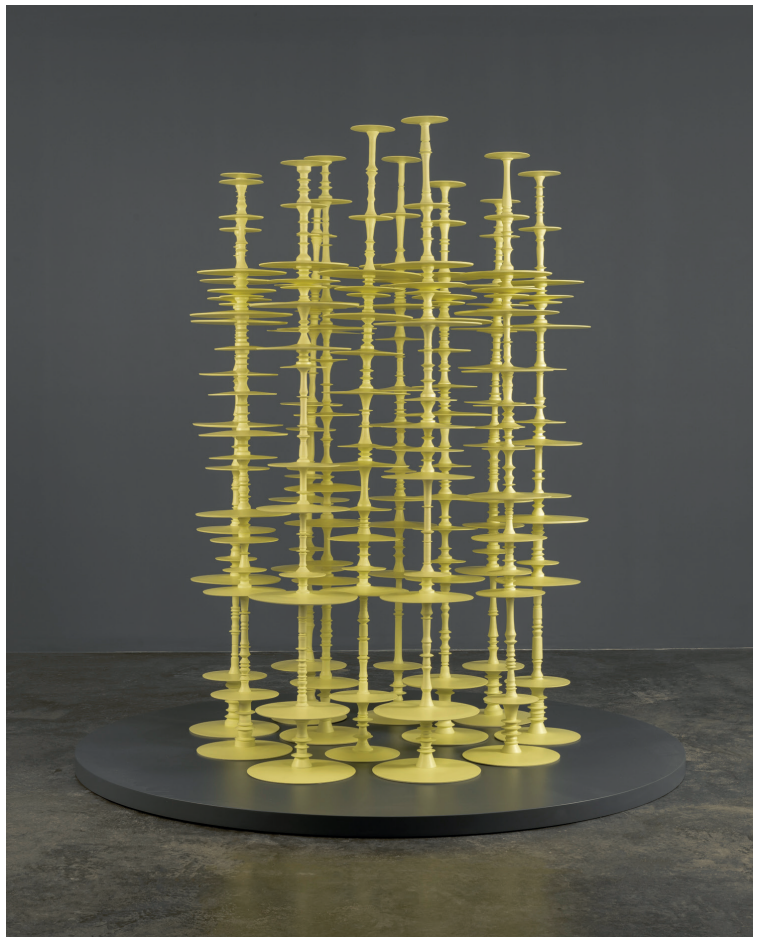
Unintended monument No: 4 - 190 x 180 x 180 cm(with pedestal) - Wooden - 2022