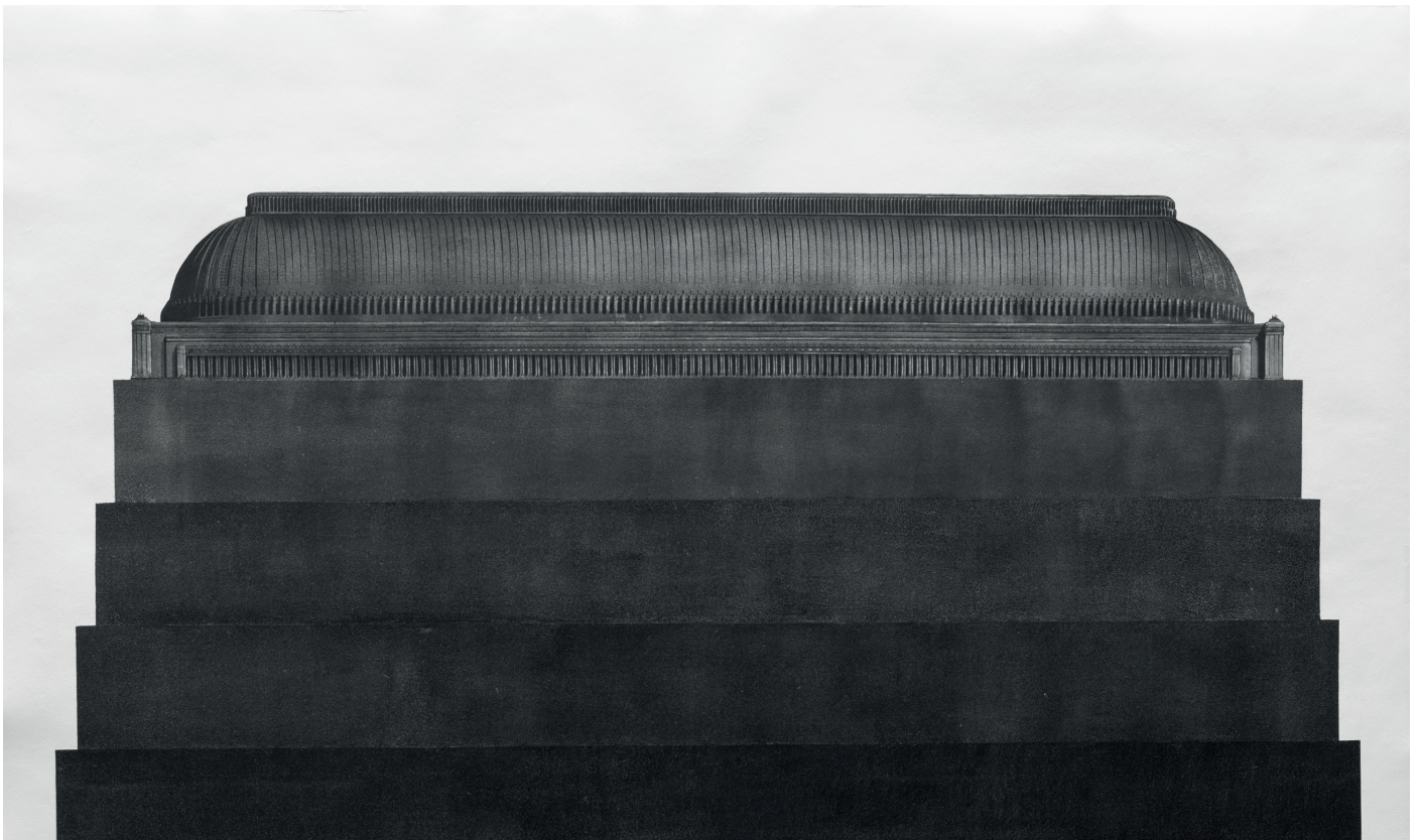
Anamorphic Architecture of Fascism - 150 x 130 - Acrylic on paper - 2014