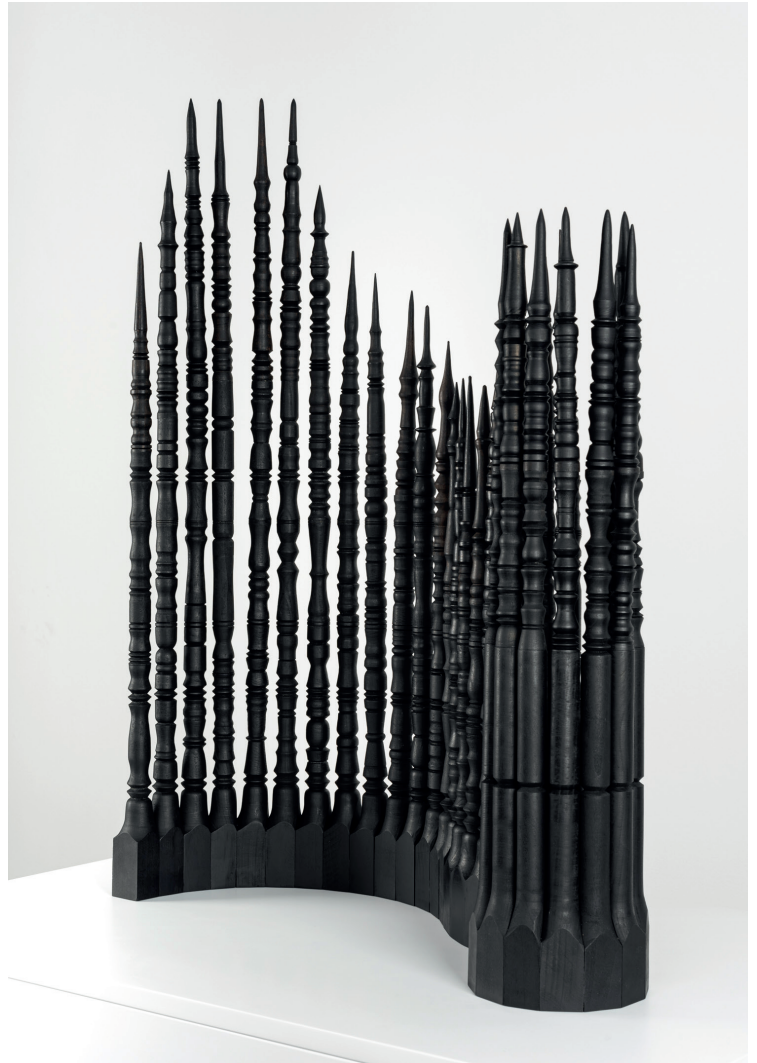
Unintended monument No: 2 - 55 x 83 x 29 cm - Wooden - 2022

Eskici questioned the architectural and public expressions of a totalitarian or centralized ideology and examined the “ideological monument” culture in the modern world with his timeless and placeless compositions, somewhat. These structures, reminiscent of a narrative by Kafka, Calvino, or Saramago, for instance, have been constructed following a shared sentiment (or fear) policy in places like Ankara, Berlin, or Rome. These “dominant” and serious-faced monuments are one of the common, founding lines of the modern world. While we’re at it: many young Republic monuments in Ankara also remind one of Mussolini’s Italy or Hitler’s Berlin. In fact, the sculpture in Güven Park was made by Anton Hanak, who was also Hitler’s sculptor. Perhaps the first person to focus on this topic in Turkey was Vahap Avşar: in the 90s, during the years when the “central government” was extremely dominant, Avşar revealed ideological ‘myths’ based on sculptures and other public structures. The stories and violences contained in monuments are still waiting to be explored: A comprehensive look at monuments with similar aesthetics and functions in various parts of the world could be a tremendous tool for analyzing modern power, not only in Turkey but also globally.