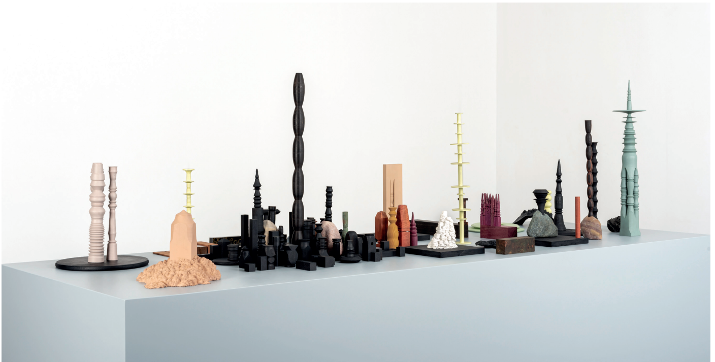
Unintended monuments, drafts, raw materials - 145 x 250 x 90 cm(with pedestal) - Wooden, stone, concrete - 2022

If you look at the exhibition text, what is aimed here is to indicate the similarity between natural structures (or “monuments,” such as the Fairy Chimneys) and non-natural (political, cultural, historical, etc.) structures, but especially as someone who has been deeply reflecting on the sociology, history, and political significance of things in recent years (or someone who has been compelled to think so, I should say, due to the borders and sensitive edges of the country), personally, I felt the shadows of bureaucracy, authority, control, and oppression even in these “civil monuments” that sometimes evoke natural forms. Or the dense and gloomy shadow of what Ece Ayhan called the “black public.” You might remember, Ece Ayhan used this term to refer to the organs of state oppression and “dominant” structures, sometimes as the opposite of the “civil” public. Yes, Ece Ayhan wasn’t a political scientist, but indeed, as a “political poet” writing civil poetry, he was one of the best at expressing this political structure.