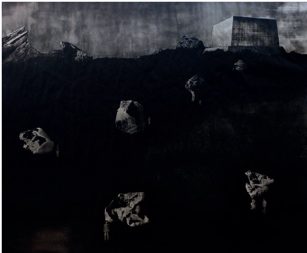
Total Institutions - Landscape - 150 x 138 - Acrylic on paper

They talked about these structures that do not fit into geometry, as an alternative to the suffocating homogeneity and predictability of what Foucault called “disciplinary” structures (schools, hospitals, prisons, and various “public” buildings), suggesting unpredictable, scattered “lines of escape,” etc. Some monuments in the exhibition have overflow states that disrupt the dominant geometry, not conforming to the schema: in some “monuments,” resembling more of a geological formation, an uncontrollable element or excess disrupts sociology with geology. I see this from a more Lacanian perspective, as the expression of something unexpressed and uncontrollable. I believe that the expression of these ‘things’ is also political. Let me put it in a way that distorts Foucault’s famous phrase: where there is control, there is also violation. The landscape isn’t all that “dark” after all.